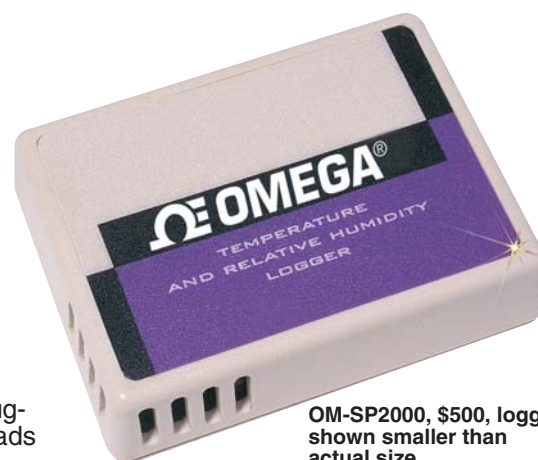
OM-SP2000, $500, logger shown smaller than actual size

Overload Protection: 30 V (reverse polarity protected)