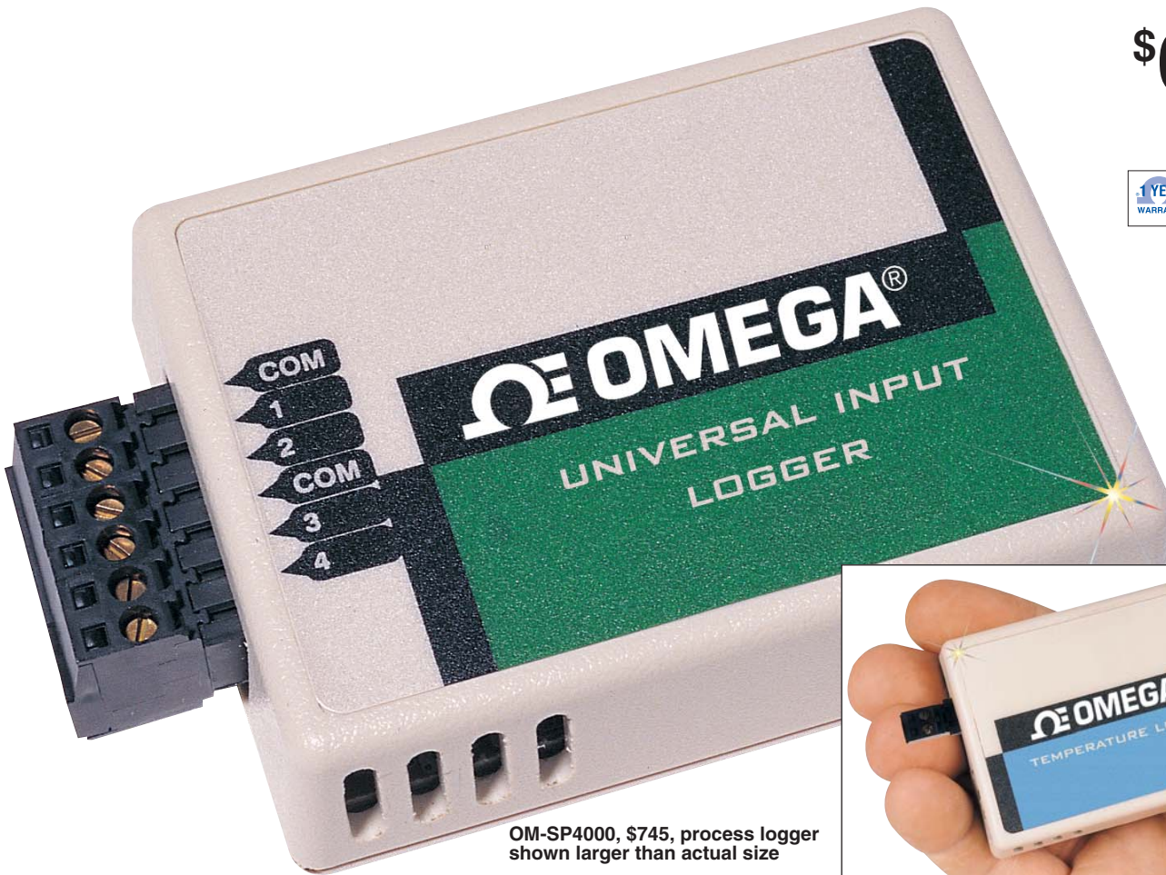
OM-SP4000, $745, process logger shown larger than actual size