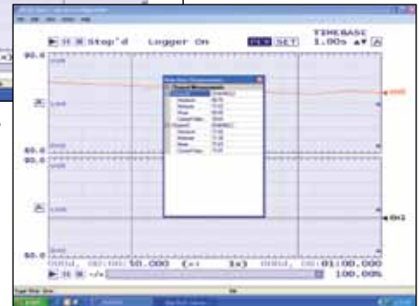
TracerDAQ-PRO Strip Chart with Measurements.

The OM-USB-1608FS Series data acquisition modules are supplied with TracerDAQ software which is a collection of four virtual instrument applications used to graphically display and store input data and generate output signals: