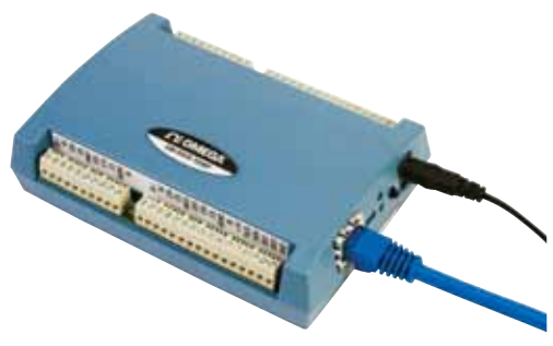
OM-WEB-TEMP shown smaller than actual size.