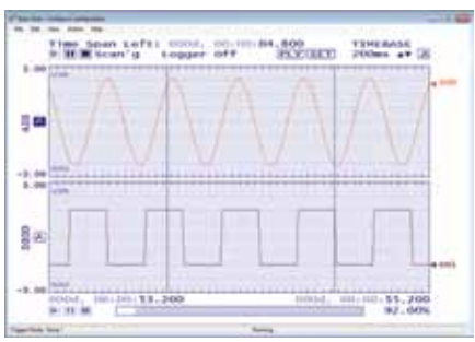
TracerDAQ Strip Chart.

Semiconductor Sensor: TMP36 or equivalent