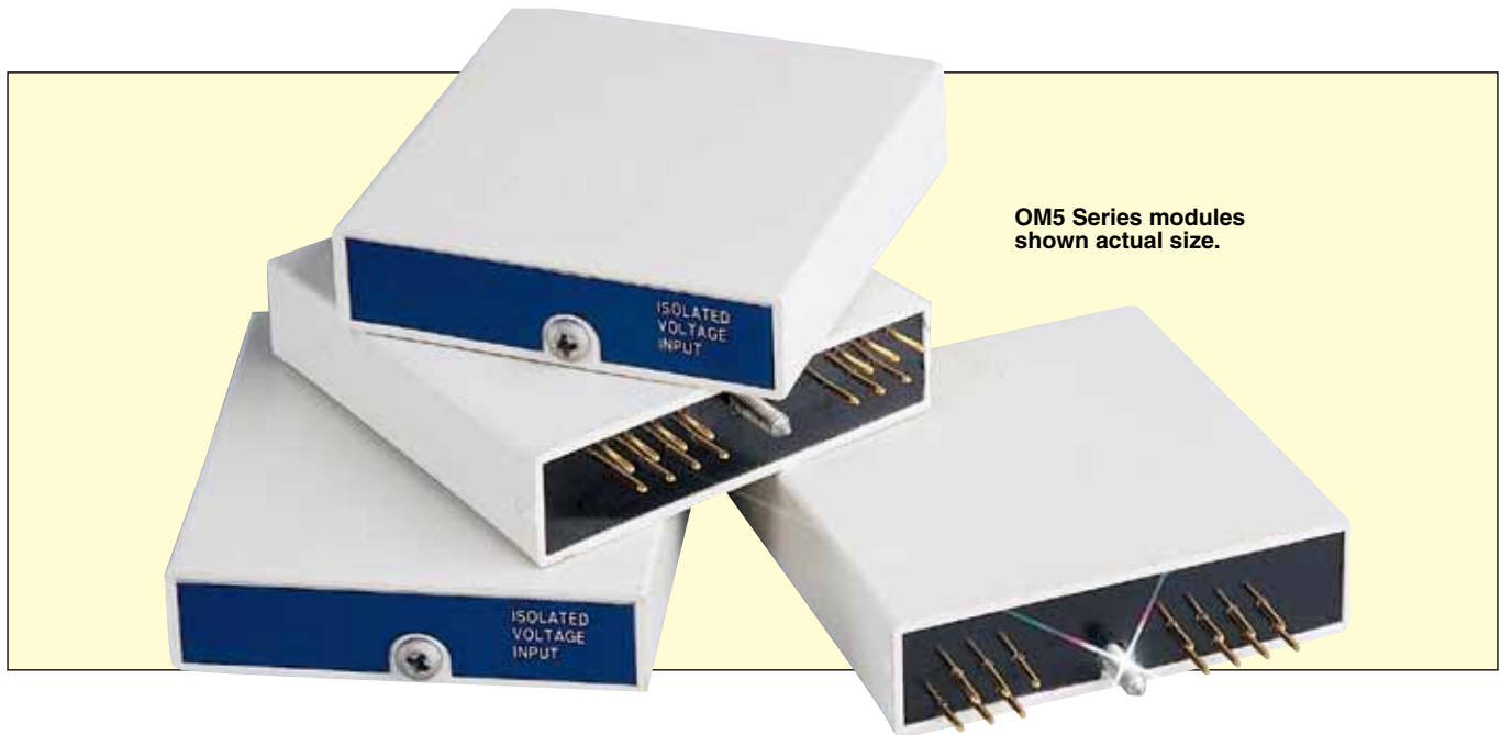
OM5 Series modules shown actual size.