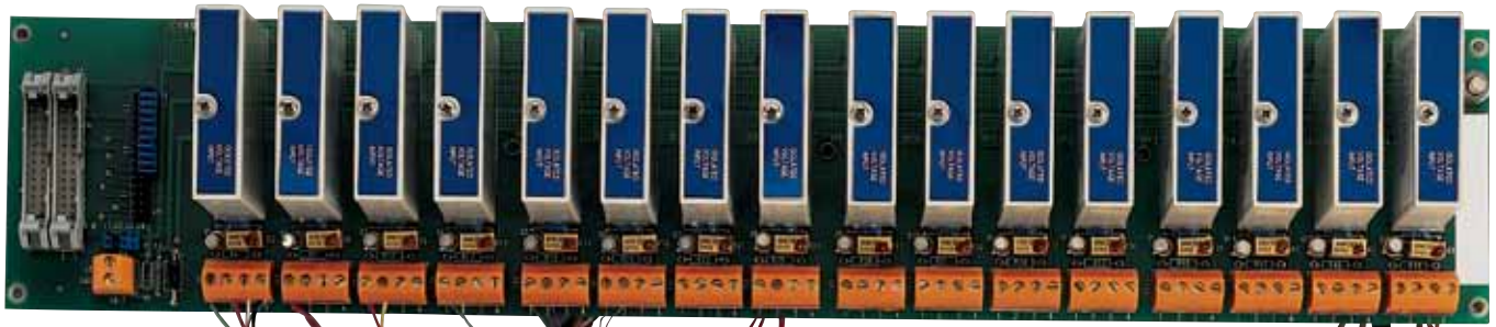
Shown with 16-channel backplane and optional sensors (sold separately).