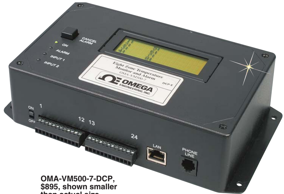
OMA-VM500-7-DCP, $895, shown smaller than actual size