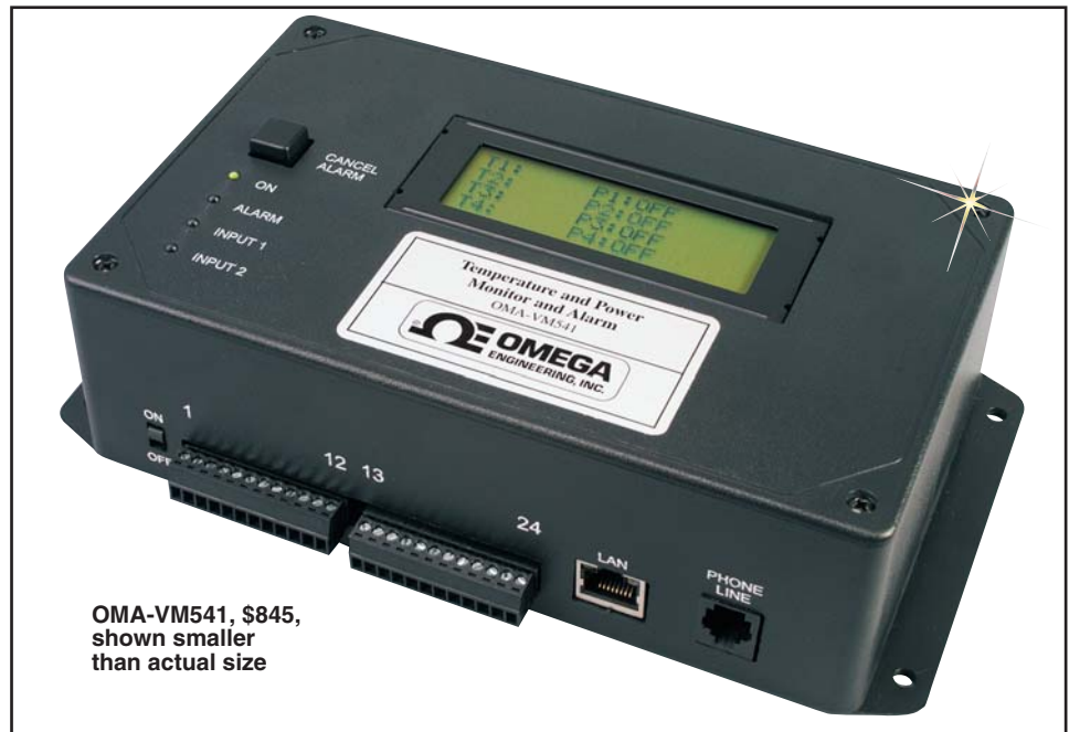
OMA-VM541, $845, shown smaller than actual size

Ambient Operating Conditions: 0 to 51°C (32 to 125°F)