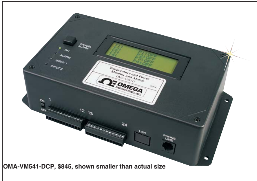
OMA-VM541-DCP, $845, shown smaller than actual size