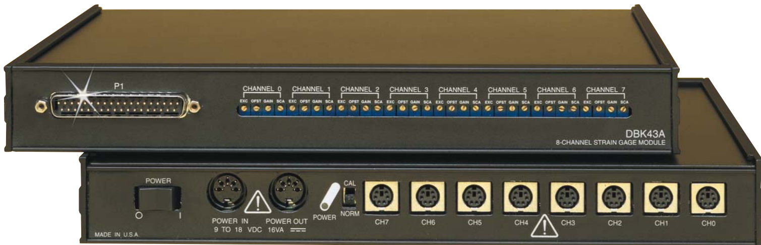
The OMB-DBK43A, $2599, shown smaller than actual size, provides 8 channels of strain-gage input for the OMB-LOGBOOK and OMB-DAQBOARD-2000 Series