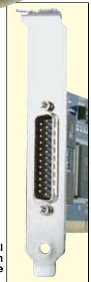
OMG-ULTRA-485-PCI end view, shown smaller than actual size