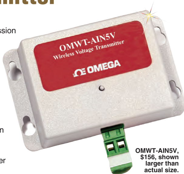
OMWT-AIN5V, $156, shown larger than actual size.

When the service switch is pushed a data transmission occurs immediately and a special mark is introduced in the ID field of the transmitted data packet to indicate which sensor is in service or installation. The service switch is also used to put the device in a quiescent mode (no transmissions and very low power consumption). This is the state the device is in when you receive it from the manufacturer. Push and hold the service switch for 10 seconds or more to enter this powered down state.