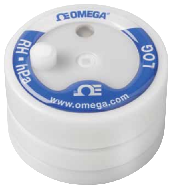
OMYL-RH23 shown larger than actual size.

OMYL-RH23E/OMYL-RH23E-4M: Internal pressure sensor with temperature and humidity sensors fitted in integral probe