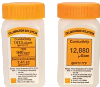
Conductivity Solution included