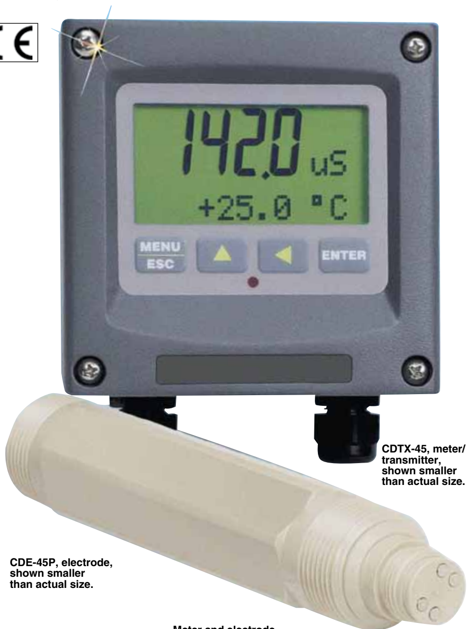
CDTX-45, meter/transmitter, shown smaller than actual size.

The microprocessor-based transmitter is loop-powered and fully isolated for high service reliability. The transmitter includes devices to protect the system from power surge and brownout events.