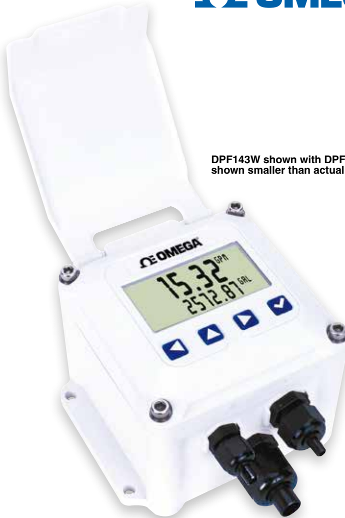
DPF143W shown with DPF140-DC, shown smaller than actual size.

The DPF140 Series meters are available in wall or panel mount configurations. Wall mounted versions can be converted from wall to meter mount with an adaptor plate. Check with Omega for compatible meters. Order the DPF144 only if a 4 to 20 mA output signal is a requirement, otherwise the DPF143 offers the most flexibility.