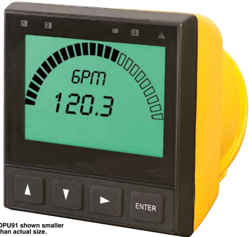
DPU91 shown smaller than actual size.

The DPU91 is offered in both panel or field-mount versions. Both configurations can run on 12 to 32 Vdc power (24 Vdc nominal). Designed for complete flexibility, plug-in modules allow the unit to easily adapt to meet changing customer needs. Optional modules include relay, direct conductivity/resistivity, batch and a PC communications configuration tool. The unit can be used with default values for quick and easy programming or can be customized with labeling, adjustable minimum and maximum dial settings, and unit and decimal measurement choices.