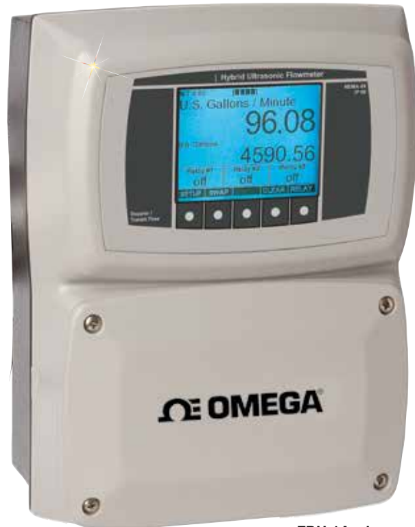
FDH-1A, shown smaller than actual size.