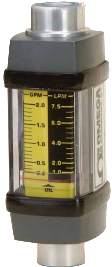
FL-2102A shown smaller than actual size.

Wetted Parts: Polyphenylene sulfide/ceramic magnet and FKM O-rings; FL-2100A has aluminum body and 302 SS spring; FL-2300ABR has brass body and 302 SS spring