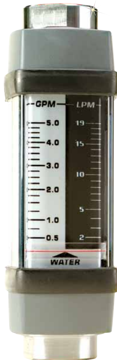
FL-6404A-316 shown actual size.

Accuracy: ±2% FS Repeatability: ±1% Connections: ½ FNPT Dimensions: 61.0 x 53.6 mm (2.4 x 2.11") for 116°C (240°F) units Length: 168 mm (6.6") for all units Maximum Pressure: 413.7 bar (6000 psig) Maximum Temperature: 116°C (240°F) Shipping Weight: 1.34 kg (2.95 lb) Metering Tube: 316 SS Float: 316 SS Spring: 316 SS Seals: FKM Magnet: Polyphenylene sulfide/ceramic