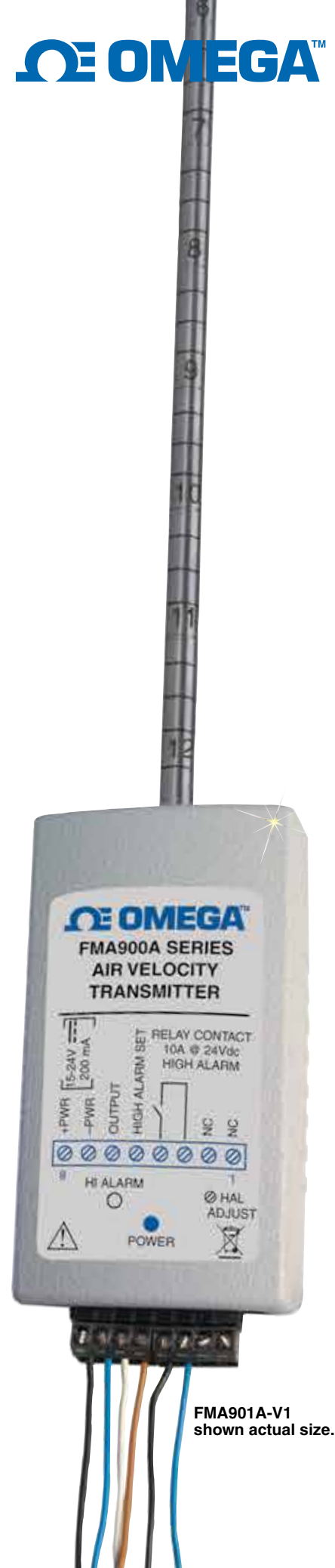
FMA901A-V1 shown actual size.