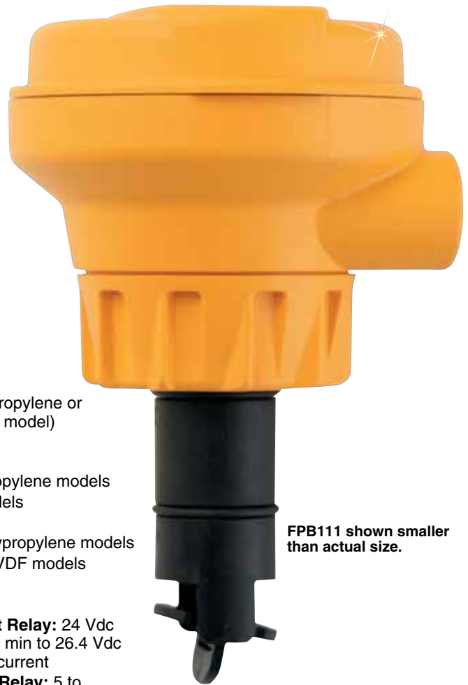
FPB111 shown smaller than actual size.

Solid-State Relay: 100 mA at 40 Vdc, 70 mA @ 33 Vac