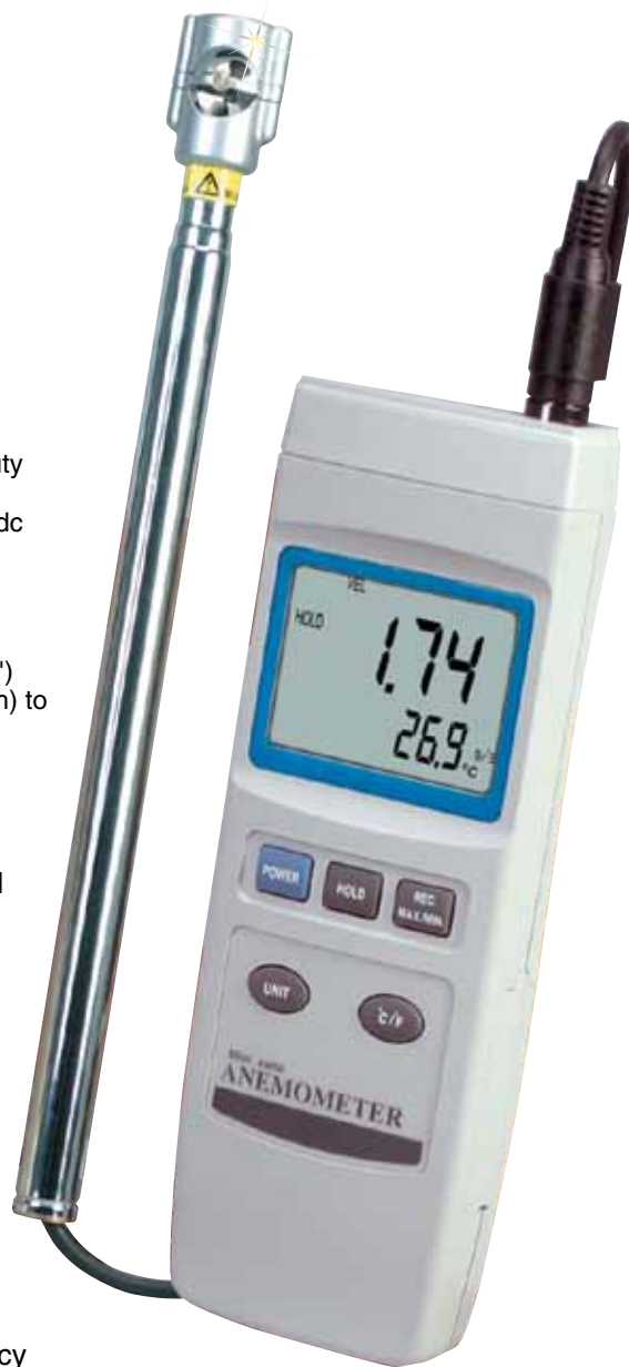
HHF801, vane anemometer shown smaller than actual size.

The HHF801 is an economical solution for any air flow application, such as, air conditioning and heating systems, wind speeds, balancing, and environmental testing. The portable HHF801 provides fast, accurate readings with digital readability and the convenience of a remote probe. The combination of a vane and standard thermistor delivers rapid and precise measurements. The microprocessor circuit assures the maximum possible accuracy and provides special functions and features.