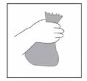
Waste is now inside bag and ready for autoclaving.