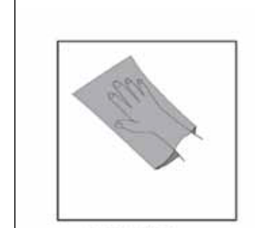
Insert gloved hand into bag.