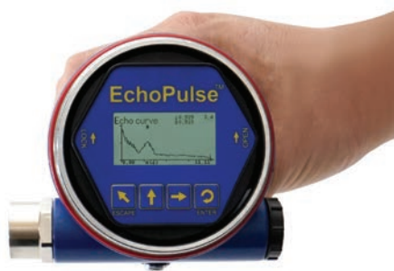
Echo Signal Return Curve Shown