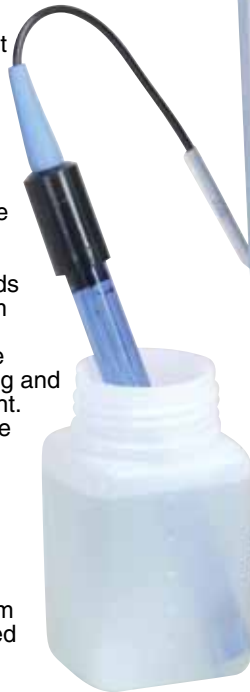
PHCN-902 shown smaller than actual size. PHE-1411 laboratory pH electrode sold separately.

The PHCN-902 is a pH controller with two setpoints for proportional dosage of acidic and alkaline solutions. Through two sets of coarse and fine trimmers, the setpoints can be accurately fine tuned to any value in the 0.00 to 14.00 range. Likewise, two trimmers on the front panel make for easy calibration. The proportional control can be adjusted to match your application through the time cycle from 0 to 90 seconds and the proportional band of 0 to 2 pH. Two pumps or valves can be wired directly to the controller and be powered through the terminals. The PHCN-902 provides for two types of alarms. The alarm relay is activated when the measurements are beyond the setpoints by more than a predetermined value in the 0 to 2 pH range. Alternatively, the relay can activate, when one of the two independently-adjustable