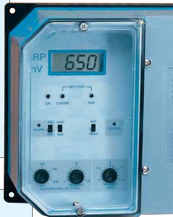
ORCN-901 shown smaller than actual size.