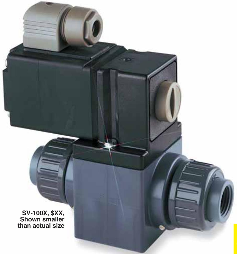
SV-100X, $XX, Shown smaller than actual size