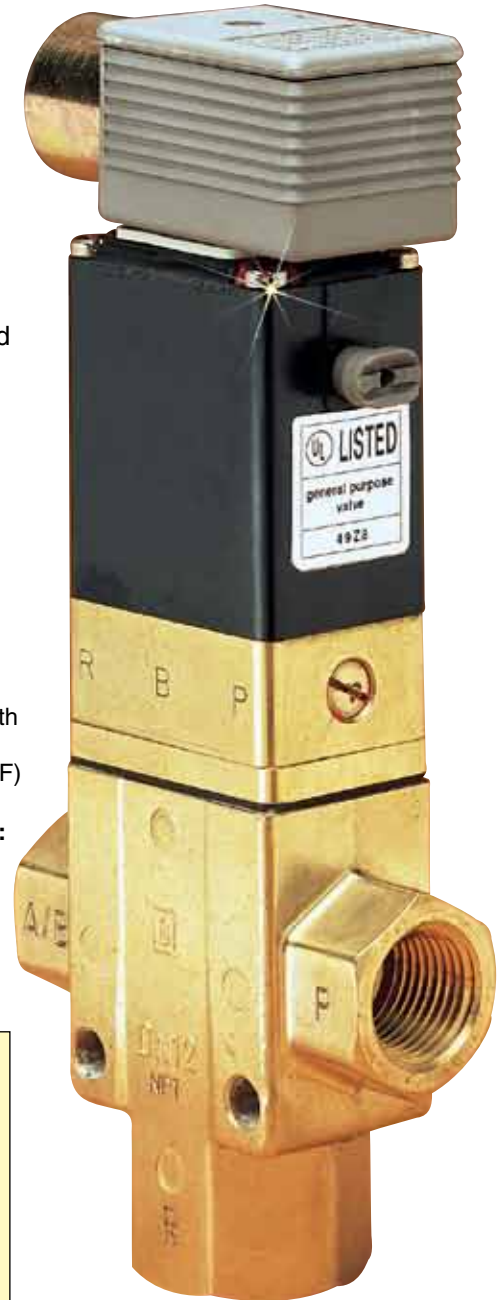
SV-1502 shown larger than actual size.

Mounting Position: Any (preferably with the solenoid system upright) Maximum Ambient Temp: 54°C (130°F) Voltage Tolerance: ±10% Power Consumption (in Warm State): AC: 30 VA/8 W Opening Time (ms): 25 to 125 depending on orifice and pressure Closing Time (ms): 25 to 125 Cycling Rate: 150 to 1000 cpm Duty Cycle: Continuous (100%)