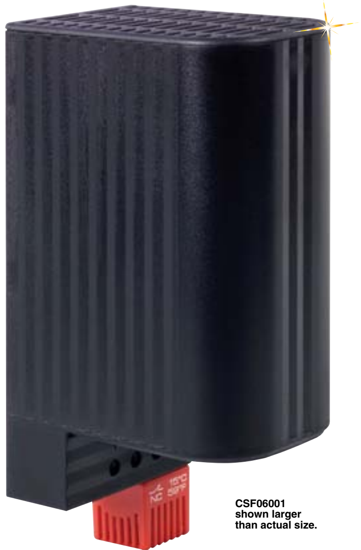
CSF06001 shown larger than actual size.

Touch-safe heater for the use in enclosures with electrical/electronic components. The design of the heater supports the natural convection which results in a high air-current of warm air. The surface temperatures on the accessible side surfaces of the housing are kept down as a result of the heater design. This model with plug-in thermostat does not require additional wiring. The heaters are designed for permanent operation. This heater is also available in a version without thermostat (CS 060).