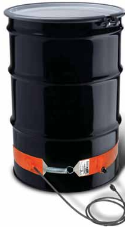
DHW-55-115-TS shown smaller than actual size.

OMEGALUX® drum heaters can easily be wrapped around a drum and attached with a simple spring and hook arrangement. Once in position, the drum heater provides uniform and even heat to the contents of the drum. OMEGALUX drum heaters are manufactured using a nickel alloy resistance wire and fully vulcanized fiberglass reinforced silicone rubber. They are resistant to mechanical damage and to attack from many chemical substances. The use of reinforced silicone rubber material as a base for the drum heater allows the design of extra flexible, very thin and efficient heaters. Each heater band is equipped with a 1.8 m (6') cord set (230 Vac heaters do not have a plug). A built-in metal screen is grounded electrically for safety. All heaters are high potential dielectric tested at 1500V at the factory. Drum heaters are available with either a 115 or 230V rating. When used with lightweight insulating blankets, drum heaters provide more efficient, more uniform heating with better temperature control. Designed for use with 55 gallon steel drums, the rugged