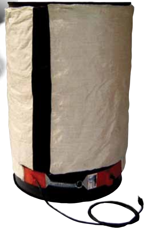
TOTE-BH-55-115-TS shown smaller than actual size.