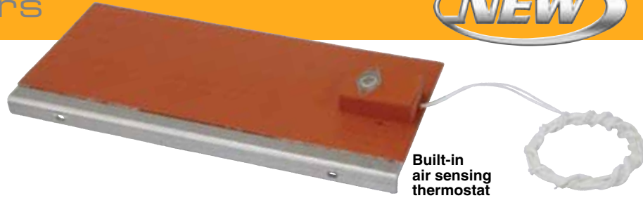
Built-in air sensing thermostat