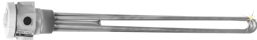
EMTS-360E2/480V/3P, $1050, shown smaller than actual size.