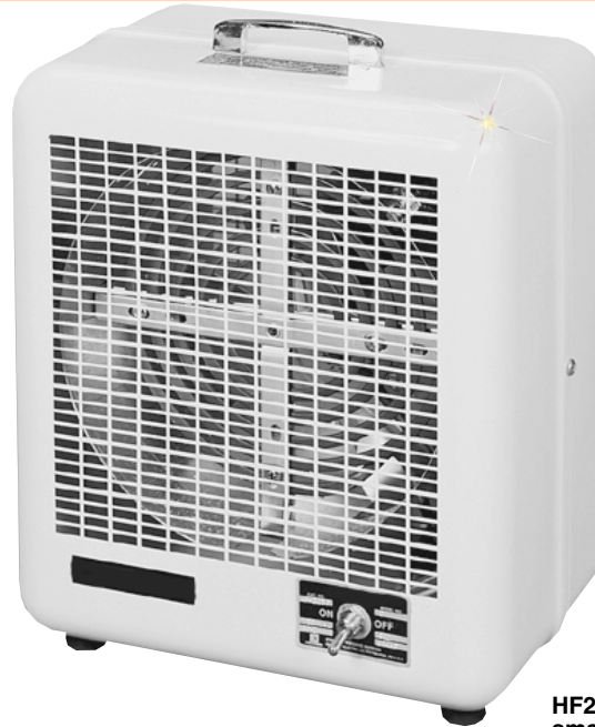
HF203G/120V shown smaller than actual size.

Housing is heavy-gauge steel with handle and rubber feet. Finish is heat-resistant green Hammerloid.