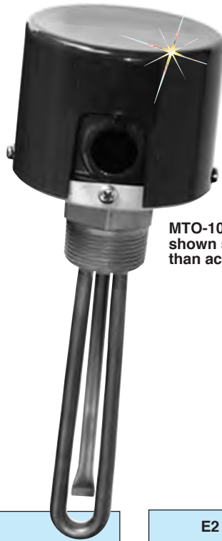
MTO-105/120, $220, shown smaller than actual size.