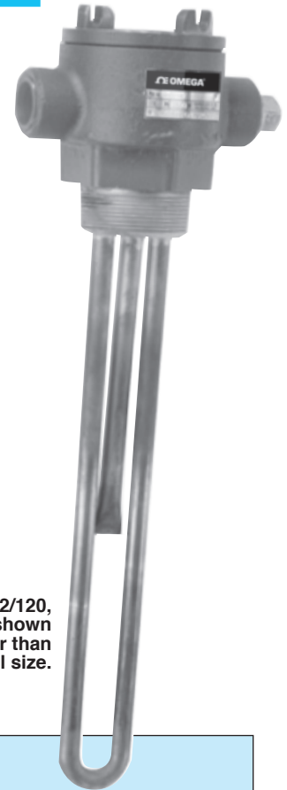
MTO-120E2/120, $500, shown smaller than actual size.