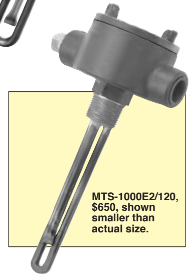
MTS-1000E2/120, $650, shown smaller than actual size.