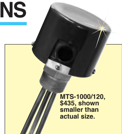
MTS-1000/120, $435, shown smaller than actual size.

Wattage: 0.75 to 3 kW Power: 120 and 240V, 1 phase Watt Density: 64 to 86 W/in 2 Screw Plug: 1 NPT stainless steel passivated screw plug Enclosures: E1 general purpose, NEMA 1 (IP00) rated, or type E2 moisture-resistant/explosion-resistant enclosure. 2