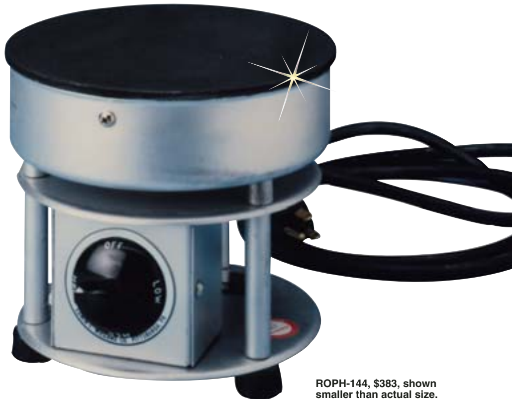
ROPH-144, $383, shown smaller than actual size.