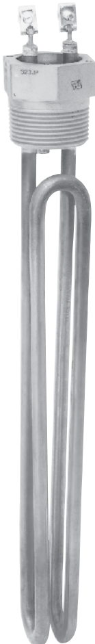
TMW-207A/120 shown smaller than actual size.