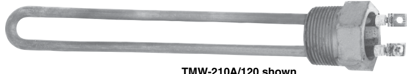
TMW-210A/120 shown smaller than actual size.