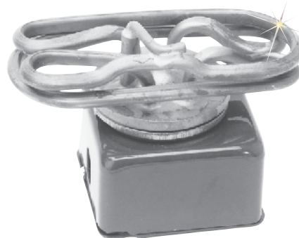
TTUH-CO-15/208V shown smaller than actual size.