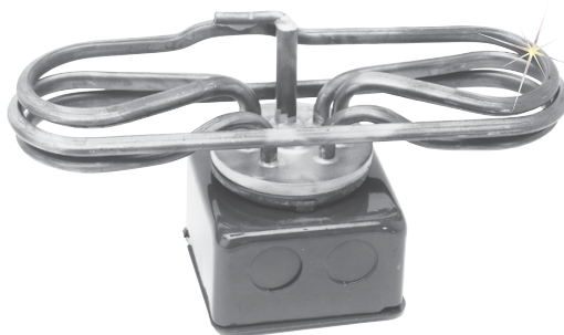
TTUH-CO-303/240/3P shown smaller than actual size.