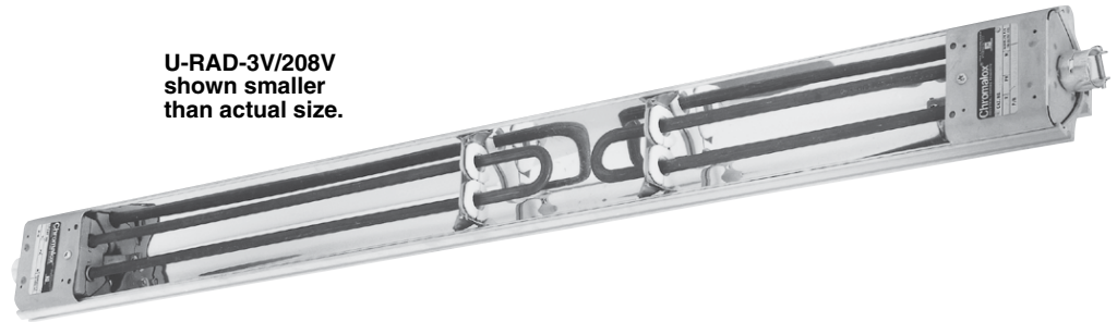
U-RAD-3V/208V shown smaller than actual size.