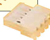
CX136-4, connector, shown actual size.

To Order Visit omega.com/cx136 for Pricing and Details