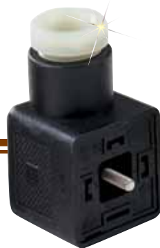
CX5300, shown smaller than actual size.