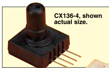
CX136-4, shown actual size.