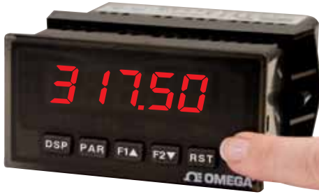
DP63800-E, shown smaller than actual size.