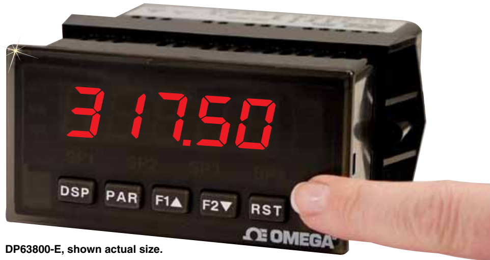
DP63800-E, shown actual size.