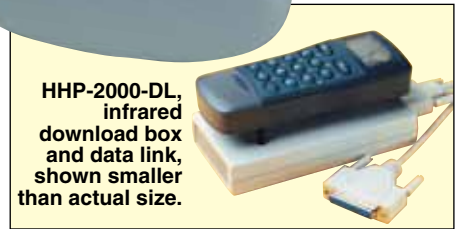
HHP-2000-DL, infrared download box and data link, shown smaller than actual size.