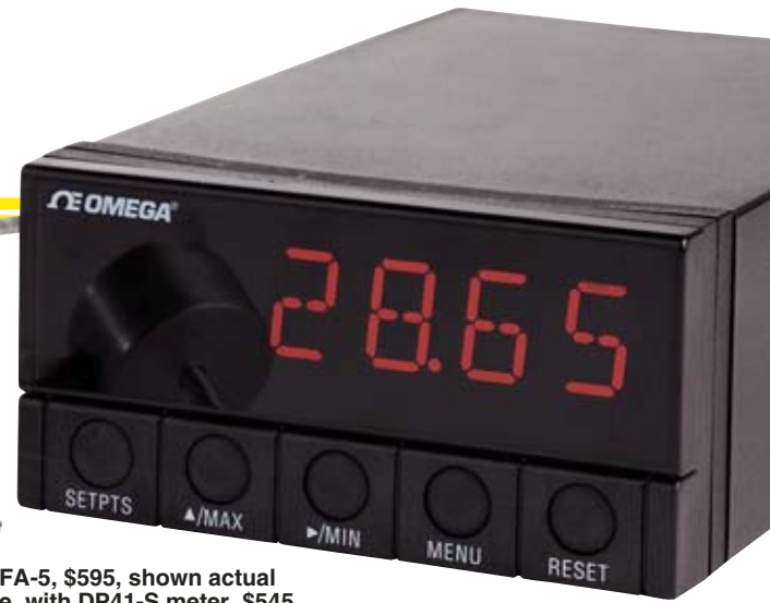
LCFA-5, $595, shown actual size, with DP41-S meter, $545. See page D-29 for details.