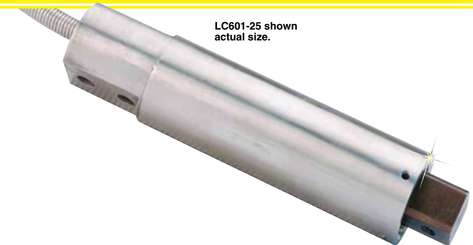
LC601-25 shown actual size.

Excitation: 10 Vdc, 15V maximum Output: 2 mV/V \pm 0.25\% 5-Point Calibration (in Compression): 0%, 50%, 100%, 50%, 0% Linearity: \pm 0.03\% FSO Hysteresis: \pm 0.03\% FSO Repeatability: \pm 0.02\% FSO Zero Balance: \pm 1\% FSO Operating Temperature Range: -34 to 82°C (-30 to 180°F) Compensated Temperature Range: 16 to 71°C (60 to 160°F) Thermal Effects: Zero: \pm 0.0025\% FSO/°F Span: \pm 0.0010\% FSO/°F Safe Overload: 150% of rated capacity Ultimate Overload: 300% of capacity Input Resistance: 360 \Omega minimum Output Resistance: 350 \pm 10 \Omega