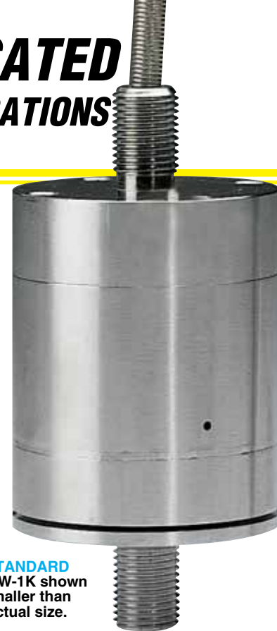
STANDARD LCUW-1K shown smaller than actual size.