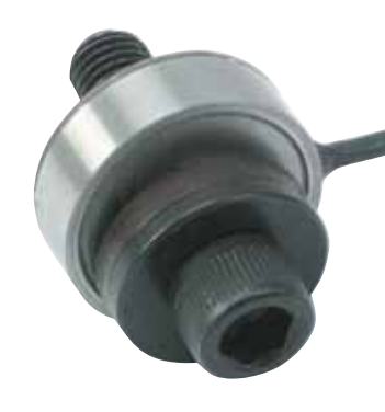
METRIC LCMWD-1KN, with spherical washers (included), shown actual size.