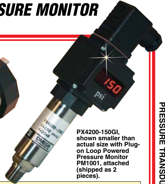
PX4200-150GI, shown smaller than actual size with Plug-on Loop Powered Pressure Monitor PM1001, attached (shipped as 2 pieces).