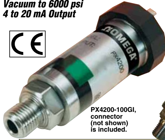
PX4200-100GI, connector (not shown) is included.