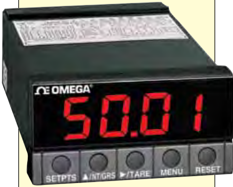
DP25B-S shown smaller than actual size. Visit omega.com/dp25b_s