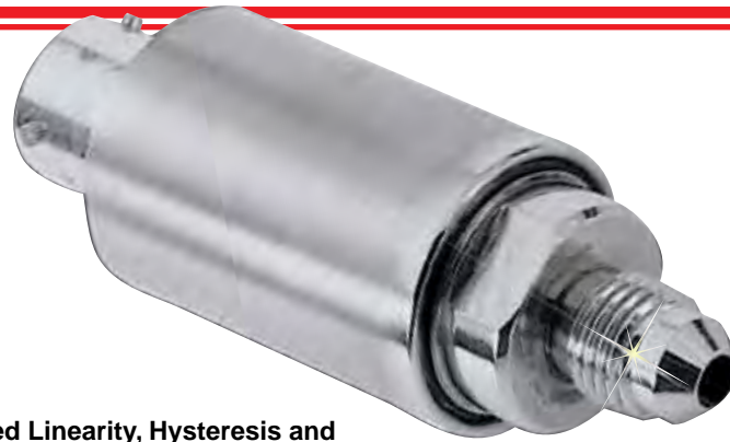
PX1000L1-100AV, shown actual size.

Excitation: 10 Vdc rated (15 Vdc maximum) Output: 30 mV typical, 26 mV minimum Residual Unbalance: Within ±2% FSO Bridge Resistance: 400 Ω nominal