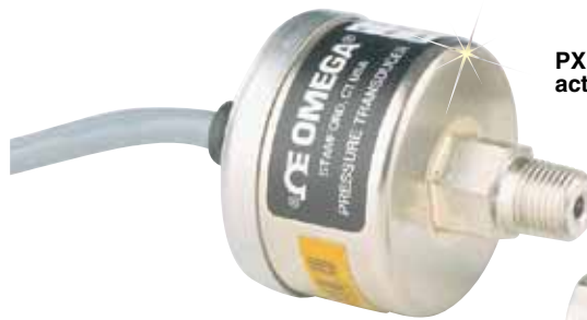
PX177-100SI, shown actual size.