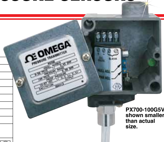
PX700-100G5V, shown smaller than actual size.