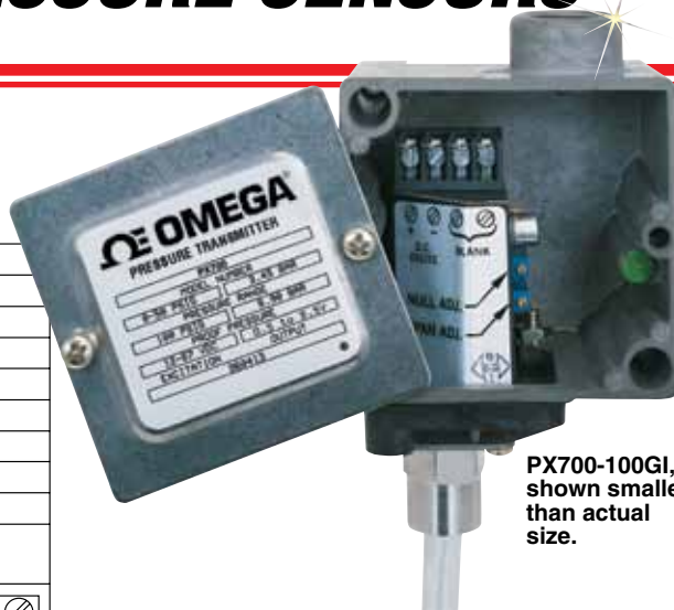
PX700-100GI, shown smaller than actual size.