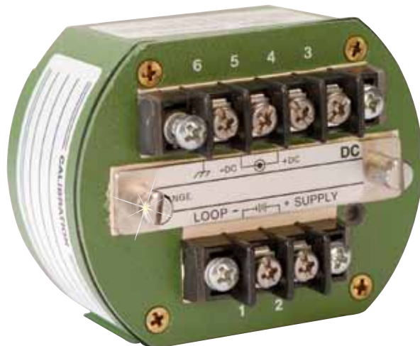
PXTX-703, shown actual size.