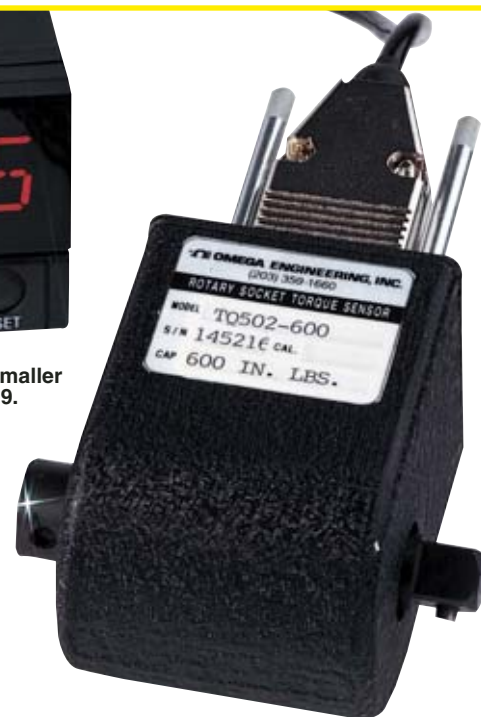
TQ502-600, $1635, shown smaller than actual size.